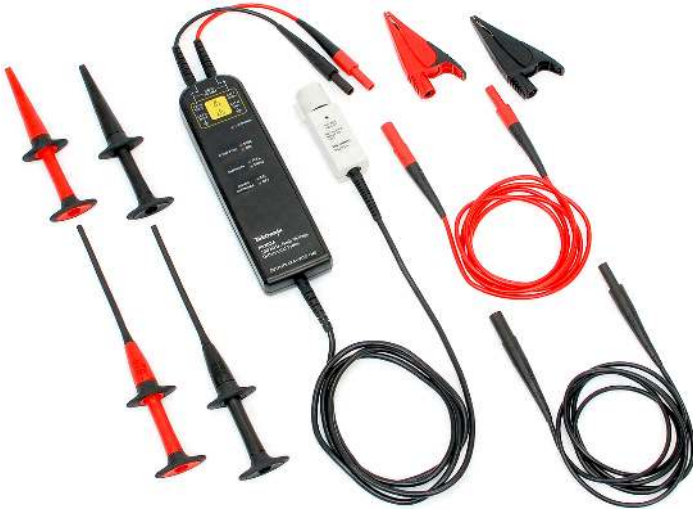
The P52xxA Series probes provide high-voltage differential measurement solutions for any oscilloscope.